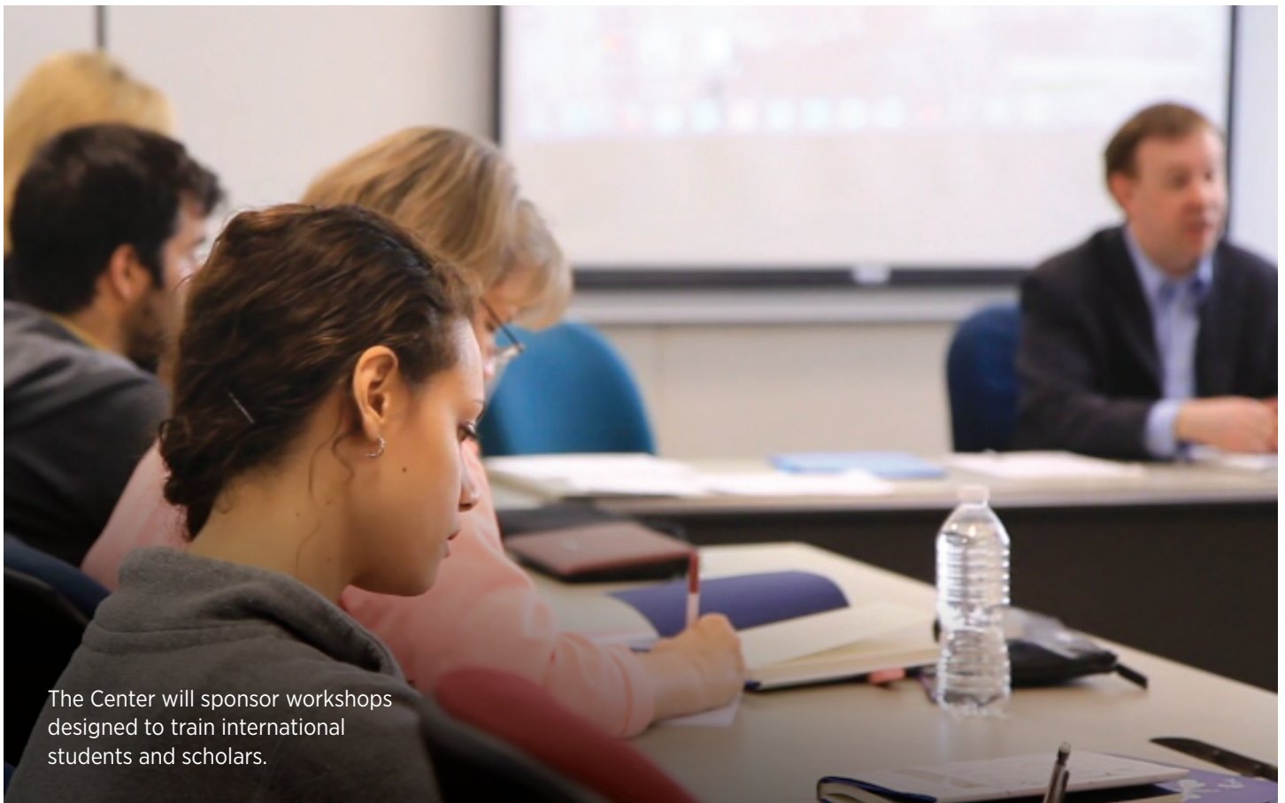
The Center will sponsor workshops designed to train international students and scholars.