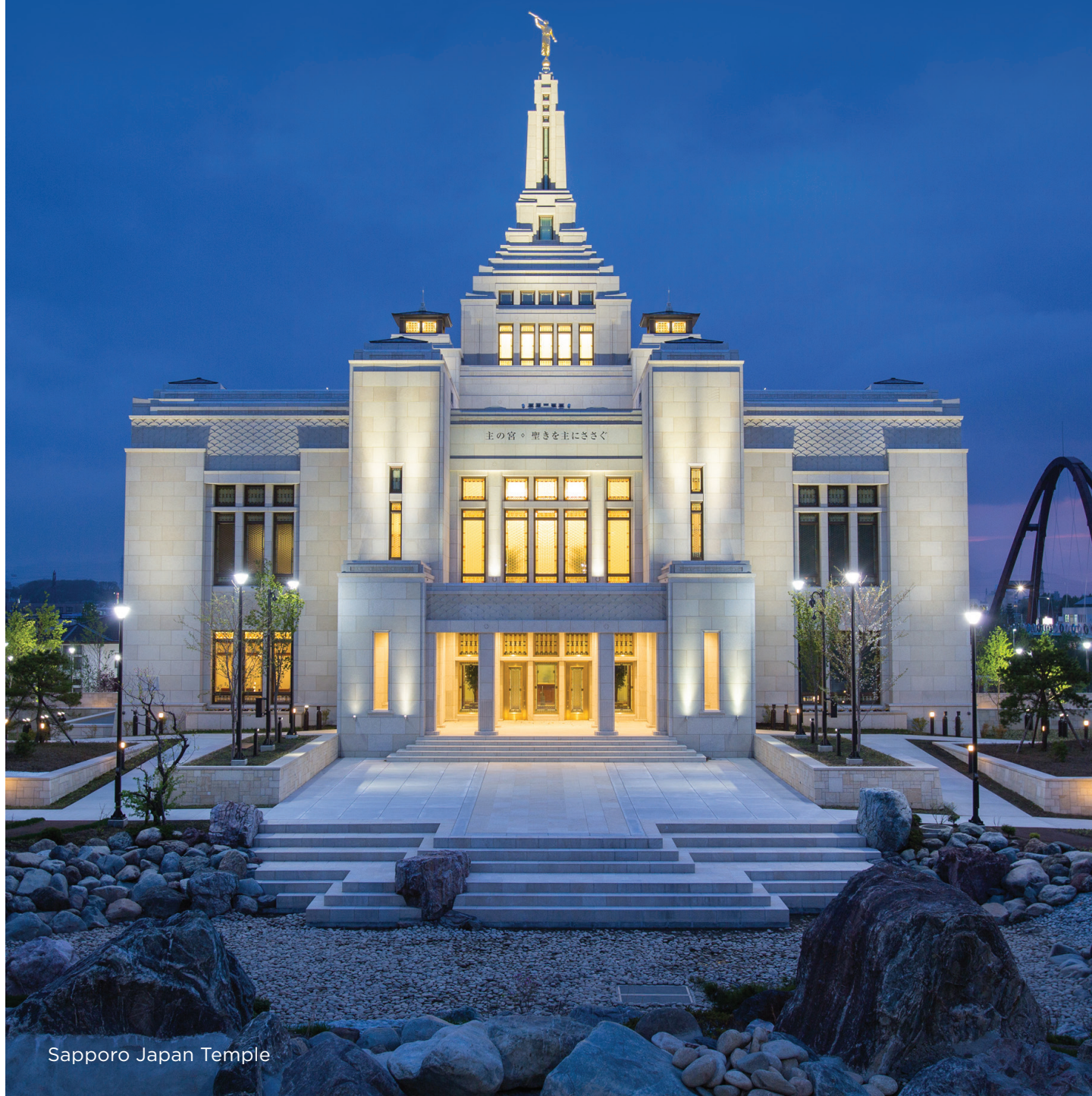
Sapporo Japan Temple

The Center will examine how Mormonism makes an impact around the globe, as well as how global cultures impact Mormonism.